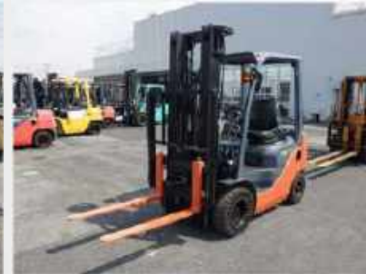
Type: Fork lift Product No: 8FG18-64128 Good Point: FSV, side sift