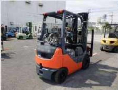
Maker: TOYOTA Model: 02-8FG15 Price: $7068