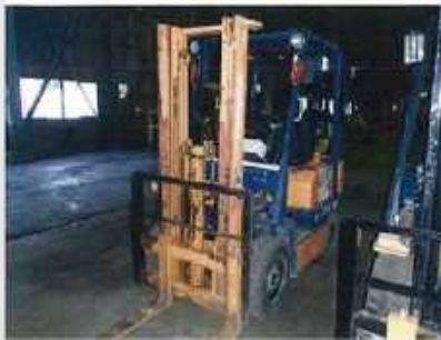
Maker: TOYOTA Model: 42-5FG15 Price: $2913