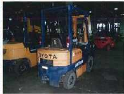
Type: Forklift Product No: 405FG18-12835