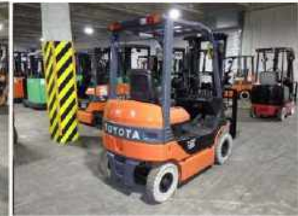
Type: Forklift Product No: 8FB15-18720