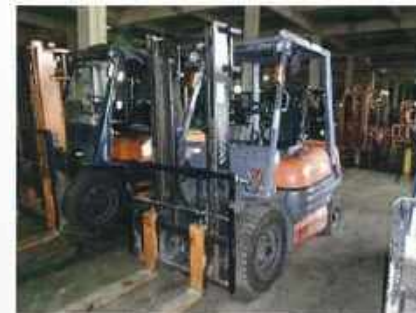
Maker: TOYOTA Model: 6FD20 Price: $5845