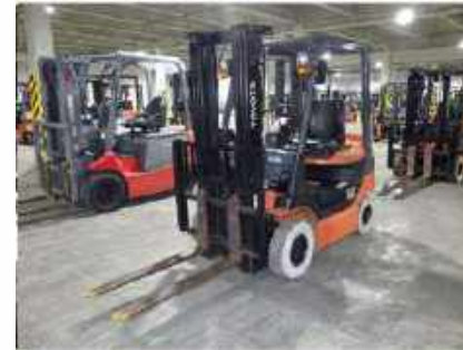
Maker: TOYOYA Model: 8FB15-18720 Price: $9520