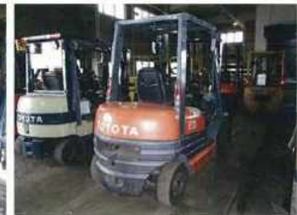
Type: Forklift Truck Product No: 39583